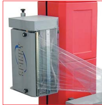
MODEL S 2300 Power pre-stretch up to 300% Rapid film reloading