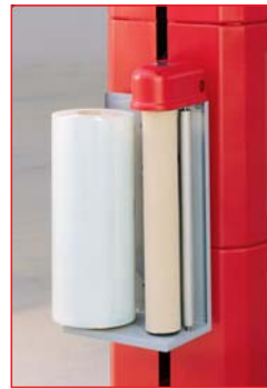
MODEL S 2200 Adjustment of film tension through electromagnetic brake